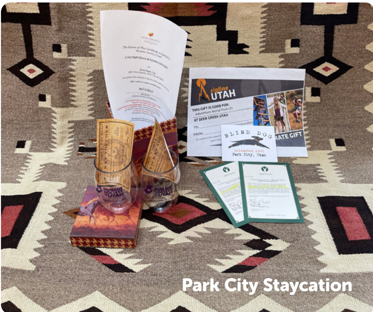
Park City Staycation